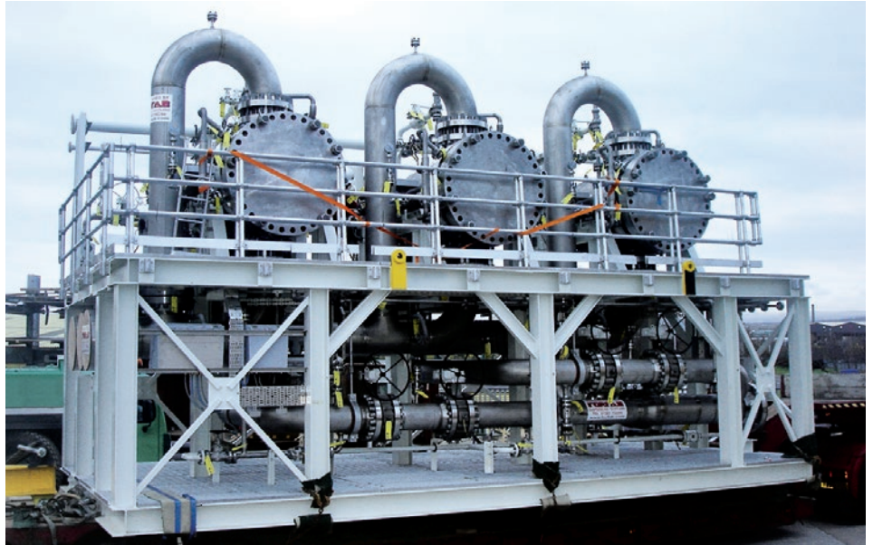
B Series technologies provide market-leading liner packing efficiency and maximized processing capabilities.

CYCLOTECH® B Series* deoiling hydrocyclone technologies represent the state of the art in produced water treatment technology, a third-generation geometry optimizing the critical balance between oil-removal efficiency and capacity. Leveraging a globally installed base on both onshore and offshore facilities, the technologies ensure that peak separation is achieved in the most cost-effective and space-efficient manner.