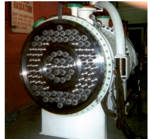
Schlumberger deoiling hydrocyclone liners are commonly manufactured in duplex stainless steel. For erosive applications, liners are available with all inlet and tapered internal surfaces manufactured from a range of wear-resistant materials.