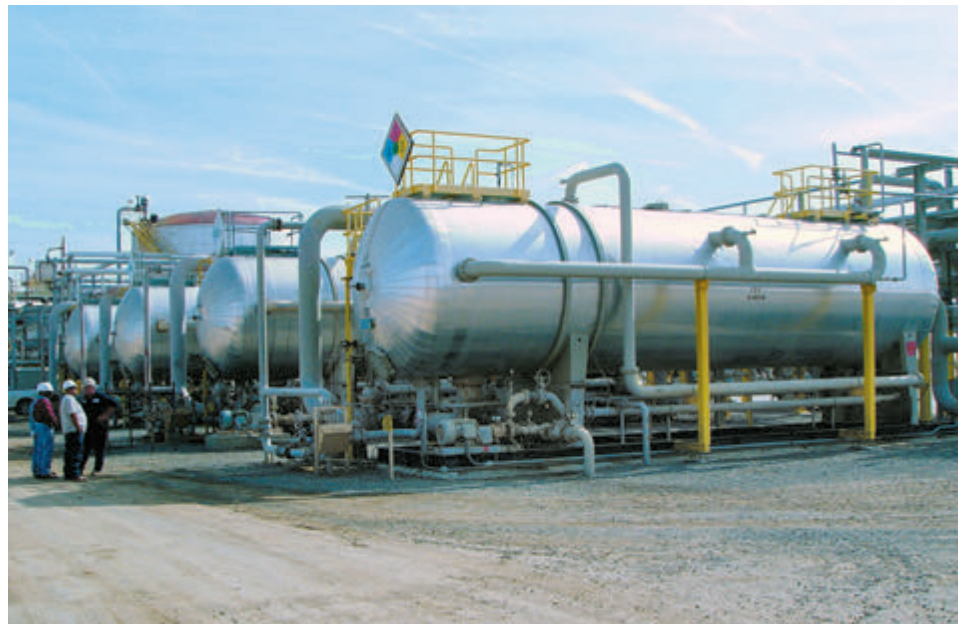
The Schlumberger WEMCO ISF unit is a compact, lightweight solution for removing oil and suspended solids from produced water and wastewater.

The WEMCO ISF system is an induced gas flotation system through which a high-velocity stream of recycled clarified water enters the cells containing influent water through eductor nozzles in the bottom of the vessel. This induces a recirculating flow of air or gas from the vessel freeboard into the process water, and a unique eductor arrangement uniformly distributes small gas bubbles throughout the cell volume. These bubbles lift contaminants to the liquid surface, forming a froth layer that is then skimmed from the liquid surface by a simple collection trough. Gas and a small volume of treated water are continuously recycled from the degassing chamber into the treatment cells. The skim cycles are automatically initiated by a timer. The cycle interval, duration, and level setpoints are all user selectable and can be changed without interrupting operation or entering the vessel. The power requirements of the WEMCO ISF system are very low; a simple recirculating pump provides gas induction and mixing in the flotation cells.