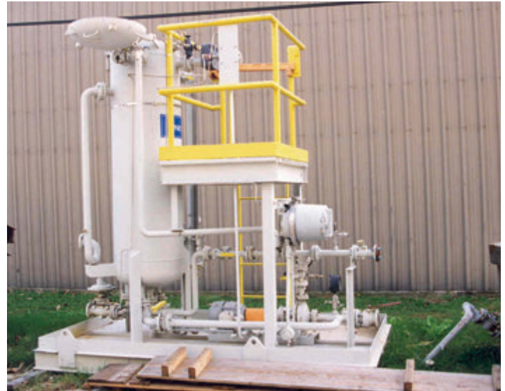
Typical UNICEL Vertical IGF unit.